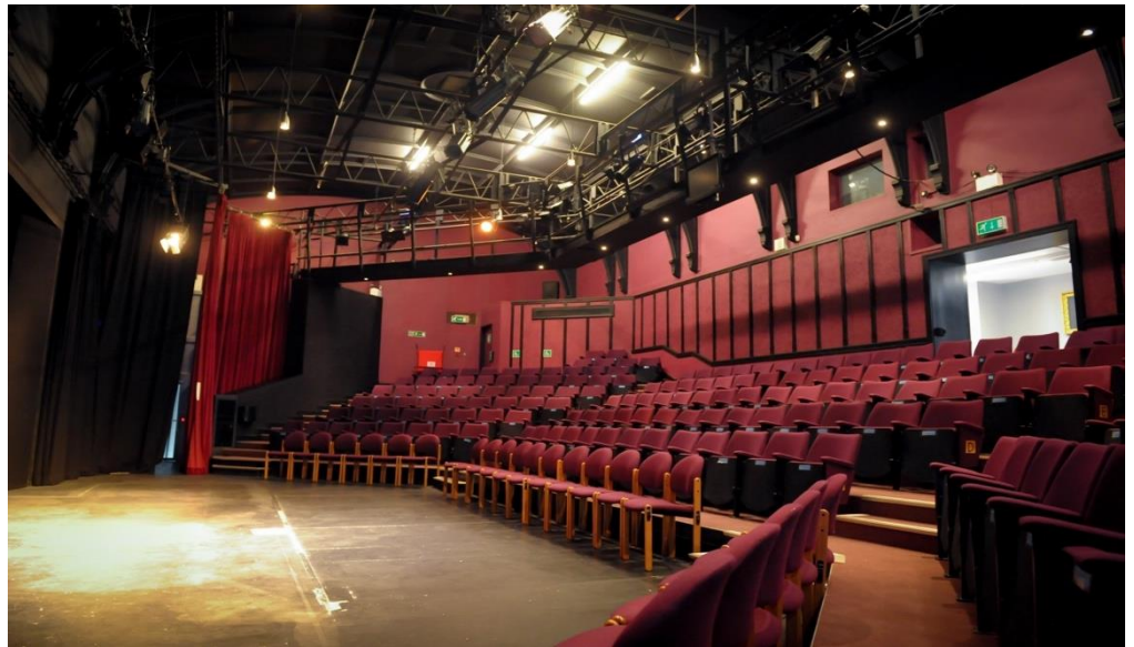
Macready Theatre Main Auditorium

In addition to the theatre's educational and community focus during term time, the Theatre & Performing Arts Technician will also have oversight of our casual technical staff who will assist the Theatre & Performing Arts Technician in the delivery of our public