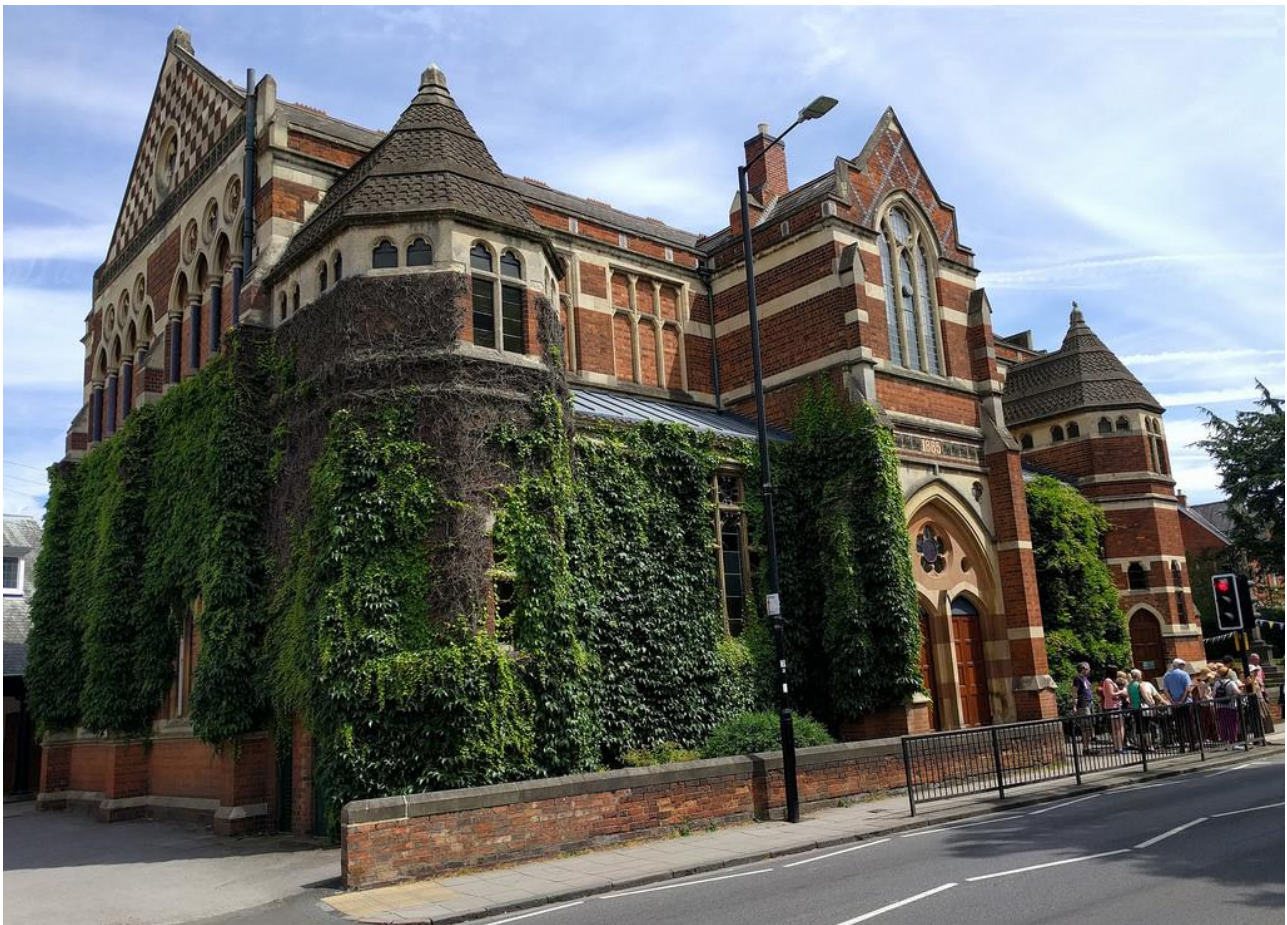
Macready Theatre, Rugby